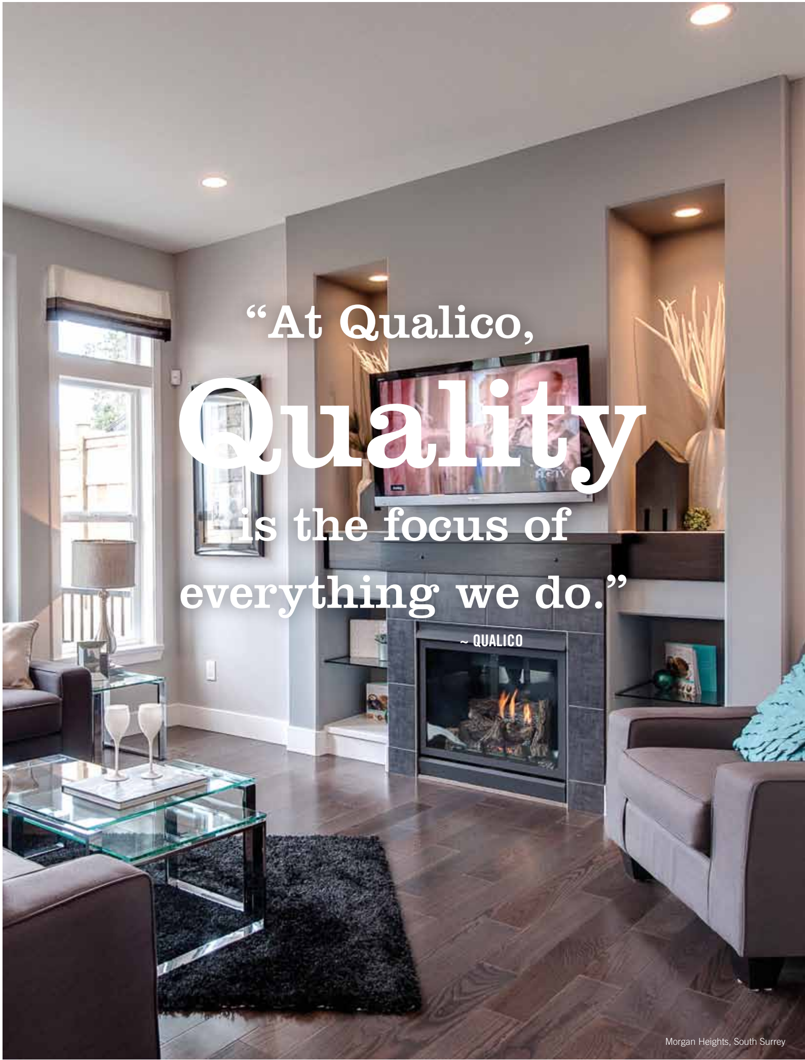
Morgan Heights, South Surrey