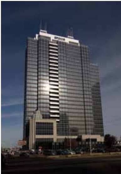
EPCOR Tower, Edmonton

Qualico is a family-owned company. Our Western Canadian values have made us who we are today. Quality is our baseline. Stewardship is our pledge. And our reputation for building solid, long-lasting homes has been earned one home at a time.