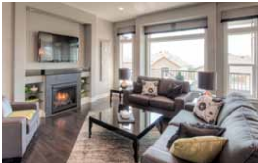
Burke Mountain Heights, Coquitlam