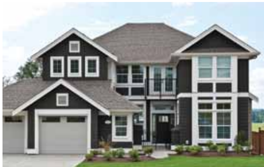
The Estates, Cloverdale