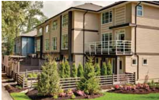
Nuvo Living, South Surrey