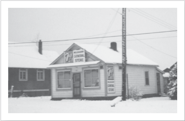
~ The Willoughby Store, next to the Willoughby Church

That’s the spirit in which Qualico, Chow & Li created Willoughby Town Centre. This is a neighbourly place to live and meet up, a place that respects the past, values community, and celebrates the fact that Langley is a great place to live. With its quality homes and commercial space, pedestrian plazas and pleasant walkways, Willoughby Town Centre has something for everyone and is delighted to be a part of the Township of Langley.